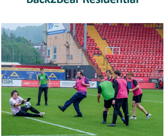
Football match at Lincoln City Stadium